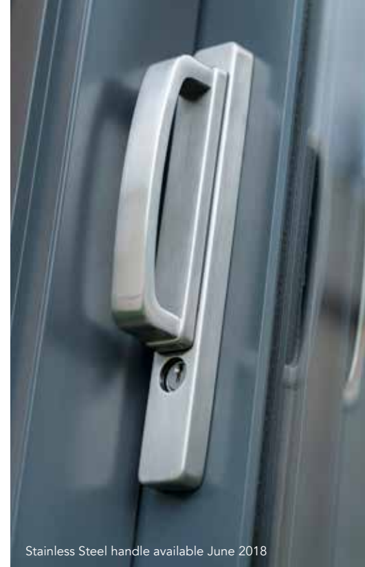
Stainless Steel handle available June 2018

Each of our WarmCore patio doors are fitted with a high security 'Anti-Snap' and 'Anti-Bump' Yale Platinum 3 Star cylinder, designed to provide maximum security against known cylinder attack methods.